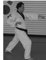
3 Ap-gubi Momtong-baro-jirugi langsam ausgeführt