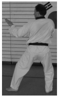
28 Dwit-gubi Sonnal-momtong-makki