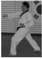
6 Ap-gubi Momtong-baro-jirugi Langsam ausgeführt