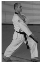
23a Ap-gubi Pyonson-kut-jochoy-chirugi