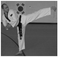
18 Yop-chagi Jumok-pyojok (siehe Bild 22 -> 23)