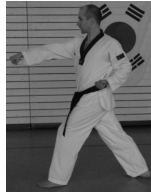
7 Ap-gubi Momtong-baro-jirugi