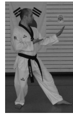
1 Dwit-gubi Sonnal-makki