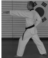
6c Ap-gubi Sonnal-bakkat-chigi