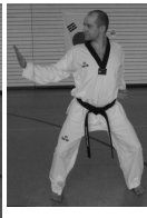
21 Juchum-sogi Hansonnal-yop-makki