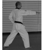
2c Ap-gubi Sonnal-bakkat-chigi

9 a = Ap-gubi Hansonnal-arae-makki 9 b = Ap-gubi Kaljebi