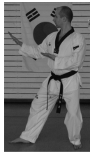
5 Dwit-gubi Sonnal-makki