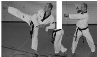
23 Yop-chagi Ap-Koa-sogi 22 Jumok-pyojok-jirugi