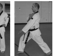
19 Ap-sogi Arae-makki