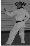
8 Dwit-gubi Momtong-an-makki