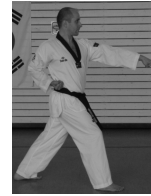
3 Ap-gubi Momtong-baro-jirugi